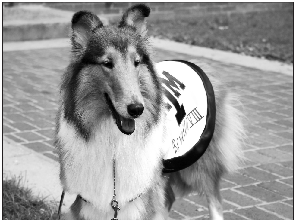
Reville VIII, who has faithfully served as the Texas A&M mascot since 2008, will formally retire following Final Review at the conclusion of the spring 2015 semester or upon selection of her successor. Until that time, she will continue to function in her current role as the First Lady of Aggieland.

This is another message regarding our fall Mini-Reunion in Fredericksburg. The time of October 11-15 is the off-weekend for football, so there'll be no excuses for you never-miss Texas Aggie football fans. The site that has been selected is arguably the most delightful small-town in the state. Those of you who have spent time there know it's true, and the rest of you need to come and see for yourselves. The hotels are as follows, and they are just across the street from each other. We have arranged reunion rates so be sure to ask for Class of '64 Reunion reservations: