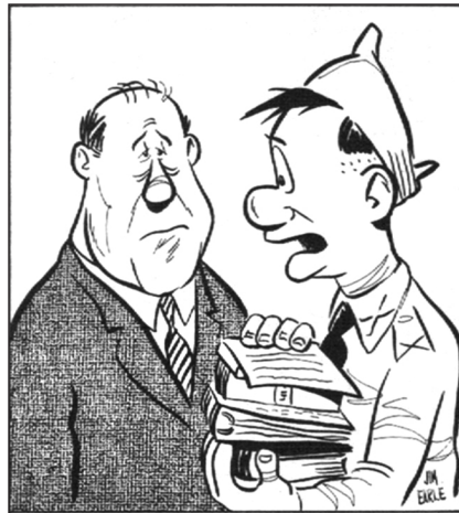
"SIR, I'M READY TO BUCKLE DOWN AND STUDY THIS LAST WEEK! WHAT MUST I DO TO BRING UP MY 32 AVERAGE?"