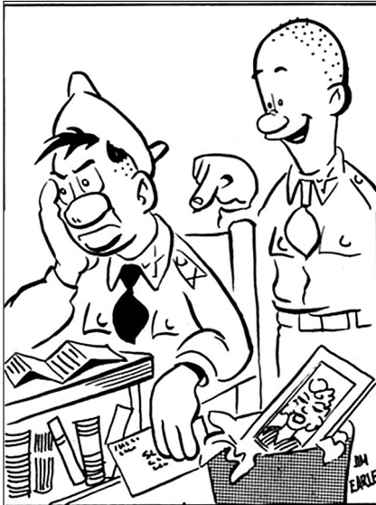
"WHAT DID YOUR GIRL'S LETTER SAY?"