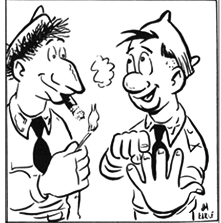
"...DENTON TONIGHT, CORPS TRIP IN DALLAS TOMORROW, BIG PARTY, HITCHHIKE BACK SUNDAY NIGHT! THE NEXT CHANGE WE'LL GET TO SLEEP IS IN CLASS MONDAY MORNING!"

of opportunity. Typical topics, according to one Batt article, included campus traffic violations, dining hall food, class assignments and campus construction. He also dealt occasionally with grads, profs and money—and “practically anything that came under the broad Aggie heading of ‘Good Bull.’”