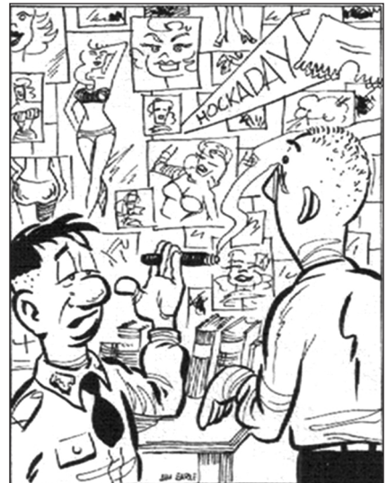
"WHAT'S ALL THIS COEDUCATION TALK? WHO WANTS GIRLS?"