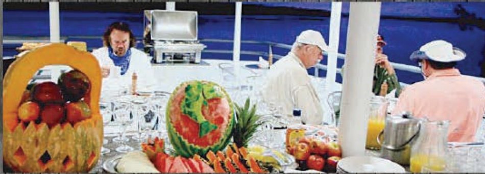
Fly Bridge / Breakfast