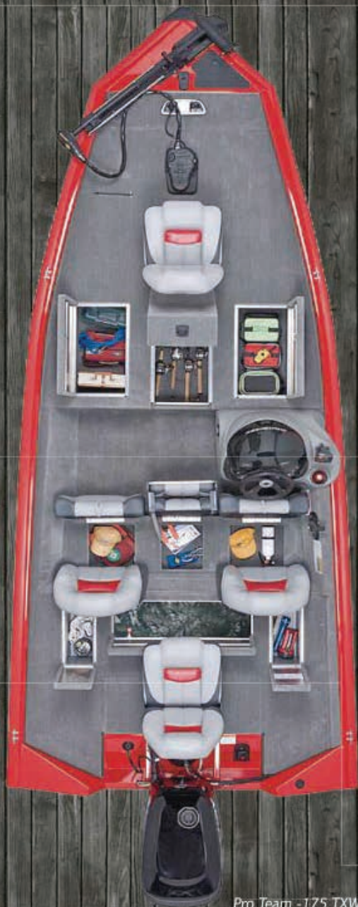
Pro Team -175 TXW

At 17' 7" (5.36 m) long, the Pro Team™ 175 TXW is a near-perfect industry pacesetter with a great combination of size and performance. It's "bullet-proof" Revolution™ Mod V hull delivers a smooth dry ride that's guaranteed. And its exclusive Power-Trac™ transom provides a quicker holeshoot and better overall performance. Equipped with a long list of name-brand components. It's #1 on the bestseller list, year after year.