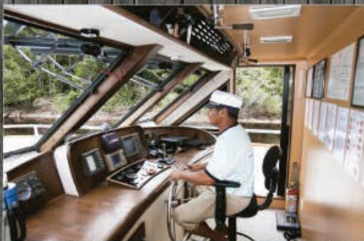
Best Captains to safely take you to remote areas