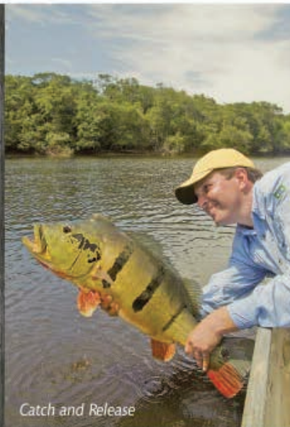
Catch and Release