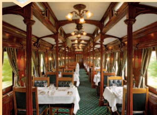
Upper: Rovos Rail suite | Lower: Dining car

Day One Your train leaves Cape Town for Pretoria. Leave behind the mountains and the verdant vineyards of the Western Cape as you make your way to the Karoo, the semidesert plateau that encompasses much of South Africa's interior. Early this evening, arrive at Matjiesfontein, a spa town founded in the 1890 by Englishman James D. Logan, who re-created a bit of Victorian London in rural South Africa.