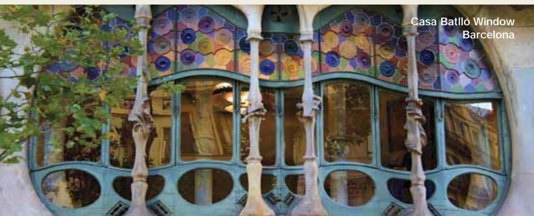
Casa Batlló Window Barcelona

Dominating the horizon and overlooking the harbor, the Palma Cathedral and Bellver Castle offer a striking first glimpse of Palma, the stunning capital of Mallorca. Winding alleys and cobbled streets characterize Old Palma, while charming windmills and an impressive 18th-century manor house beckon from the verdant countryside.