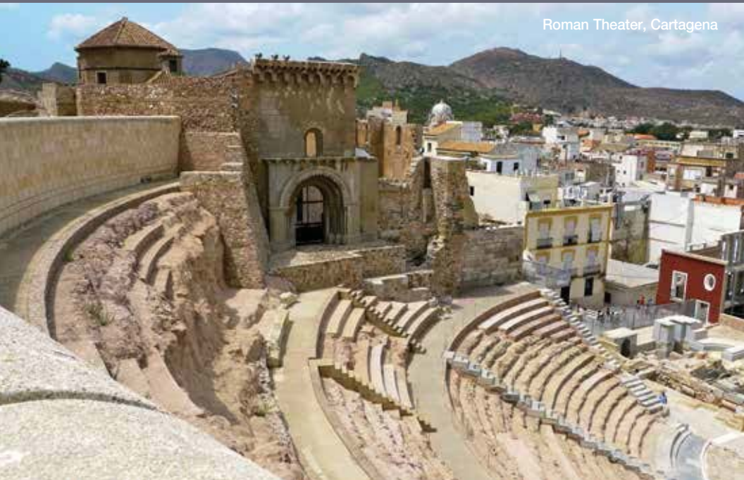
Roman Theater, Cartagena