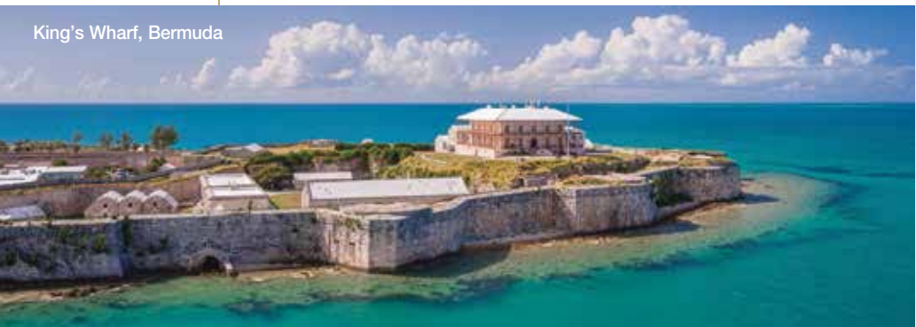
King's Wharf, Bermuda

Oceania Cruises may modify the cruise itinerary up to and during the voyage. Air arrangements, cruise accommodations, local transportation, and optional shore excursions are arranged by Oceania Cruises, which may use other suppliers or providers to render the services. The agreement in this brochure is the exclusive and entire statement of the agreement between you and Go Next, Inc. It should be read carefully.