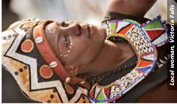
Local woman, Victoria Falls