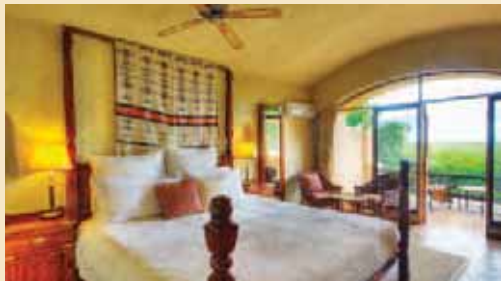
CHOBE GAME LODGE CHOBE NATIONAL PARK