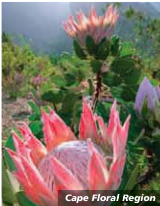
Cape Floral Region