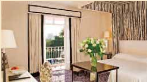
BELMOND MOUNT NELSON HOTEL CAPE TOWN