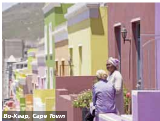
Bo-Kaap, Cape Town