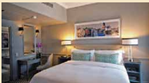
54 ON BATH JOHANNESBURG