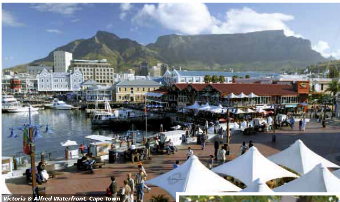
Victoria & Alfred Waterfront, Cape Town

Discover the rich natural and cultural heritage of southern Africa. Cape Town is a showcase of Cape Dutch houses and inspiring landmarks, including Robben Island and St. George's Cathedral. Across the country, Soweto, once the main battleground in the war on apartheid, now offers opportunity and hope for a better future. No trip to southern Africa would be complete without a safari in its greatest parks and game reserves. Experience the thrill of up-close encounters with lions lazing in the grass after a kill or elephants quenching their thirst by a watering hole, and feel the power of thundering Victoria Falls.