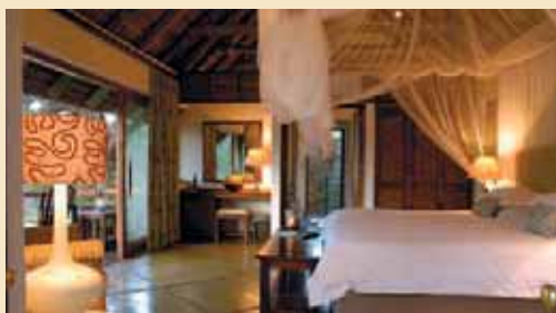
THORNYBUSH GAME LODGE THORNYBUSH GAME RESERVE

Our travel experts have selected these luxury properties for your comfort. The hotels' prime locations put the cities at your doorstep, and the game lodges sit in the heart of game-rich parks, allowing you to immerse yourself fully in the safari experience. Details in the design and décor celebrate the local culture and enhance the ambience of each hotel and lodge. Their restaurants feature menus of elegantly prepared local and international cuisine. Of utmost importance is the superior quality of the services, amenities and accommodations, allowing you to maximize the enjoyment of your stay.