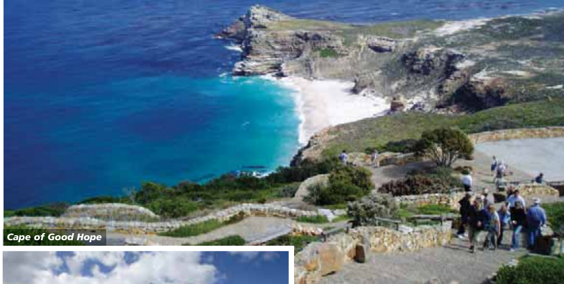
Cape of Good Hope