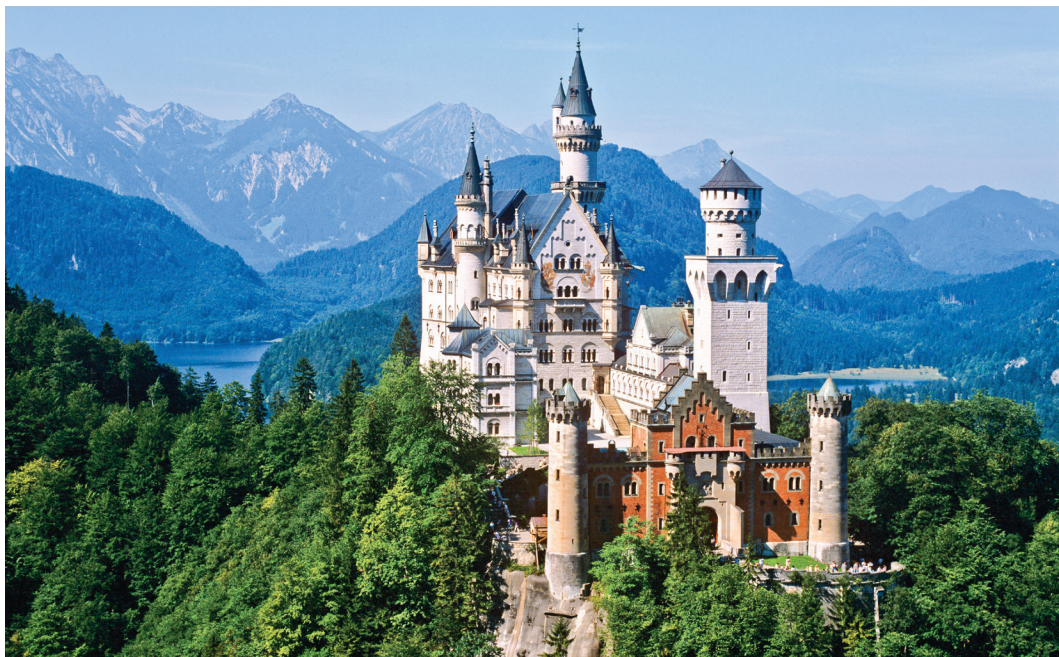
We see the fairy tale castle of Neuschwanstein in the Bavarian Alps on Day 7.

Bavarian Alps. Mid-afternoon we reach our hotel set amid the stunning Bavarian alpine scenery. B,D