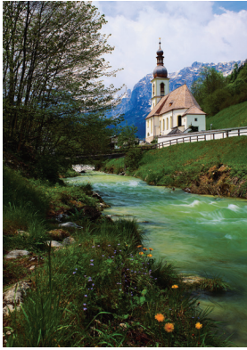
Serene German countryside

Day 13: Berlin Germany’s capital, its largest city, cultural center, and beating heart, Berlin is both provincial and international, historic and up-to-the-minute, sophisticated and friendly. We get our first taste on this morning’s tour featuring the Brandenburg Gate, the triumphal arch now a symbol of reunification; and Pergamon Museum housing treasures from the Turkish archaeological site. We visit the Berlin Wall Memorial, the remaining section of the partition that brutally divided the city – and the nation – from 1961 to 1989. Now a historical monument and tribute to victims, the memorial traces the history of the