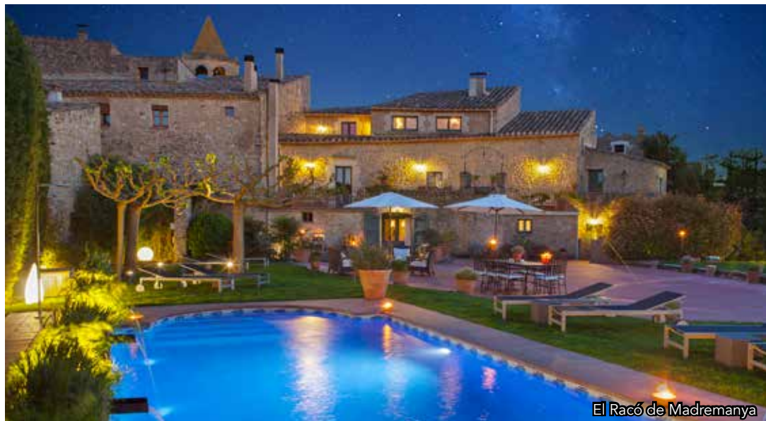
El Racó de Madremanya