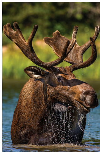
We may see moose in Glacier NP.

Day 10: Banff Our last full day in the Canadian Rockies begins with a ride aboard the Banff Gondola