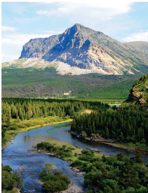
A magnificent vista in Glacier National Park