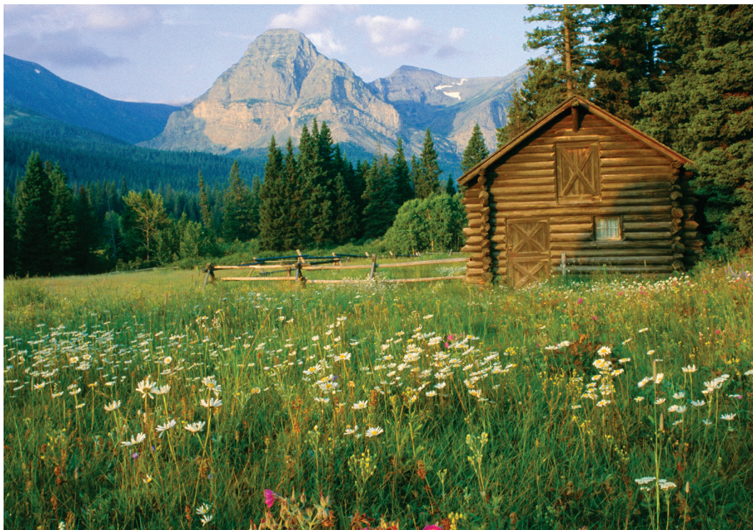
A scene in Glacier National Park, which we explore on Days 3 & 4

winding mountain pass that offers breathtaking views and hair-raising turns. After time for lunch on our own we meet up with our motorcoach and continue southwest across the Continental Divide. After arriving late this afternoon in the resort town of Whitefish, Montana, we dine together tonight. B,D