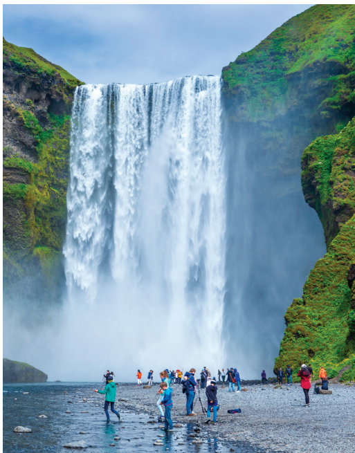
We visit popular Skogafoss on Day 3.