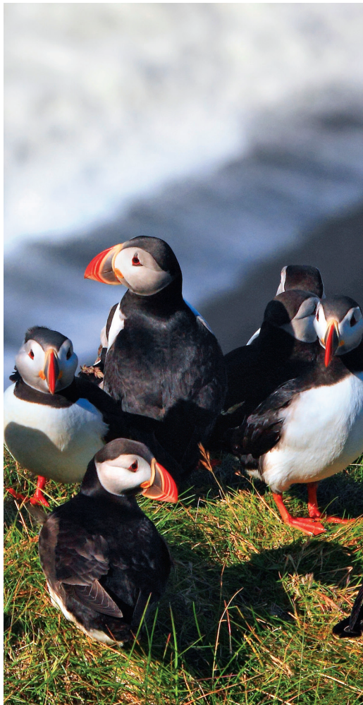
We may see puffins on our tour.

Day 11: Depart for U.S. Today we depart for the airport and our return flights to the U.S. B