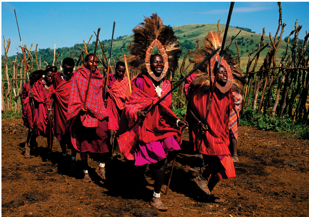
We visit a Maasai village to learn about their culture.

Day 8: Ngorongoro Crater On our morning tour of the 100-square-mile crater, we have our only chance to see all of Africa’s “Big Five” – elephant, buffalo, rhino, lion, and leopard – in one place. B,L,D