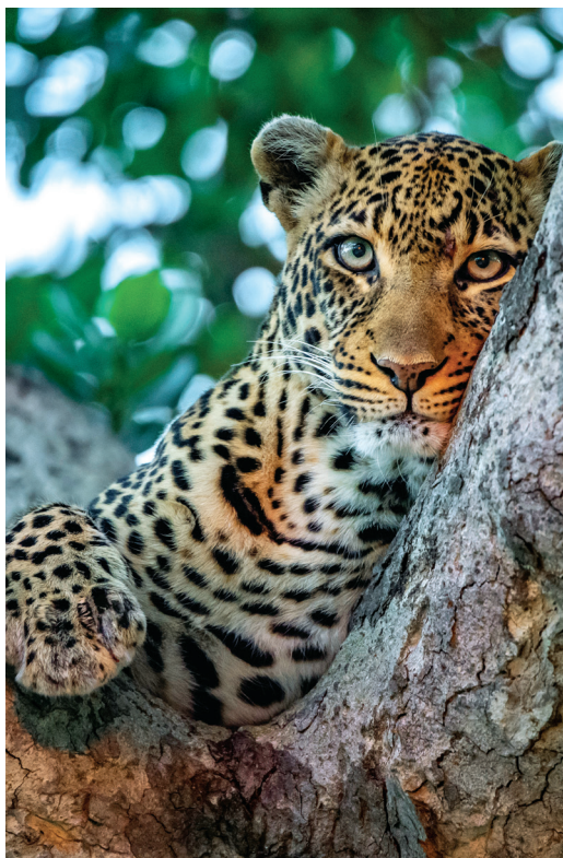
Leopard in the Serengeti

Day 16: Arrive U.S. We reach the U.S. today and connect with our flights home.