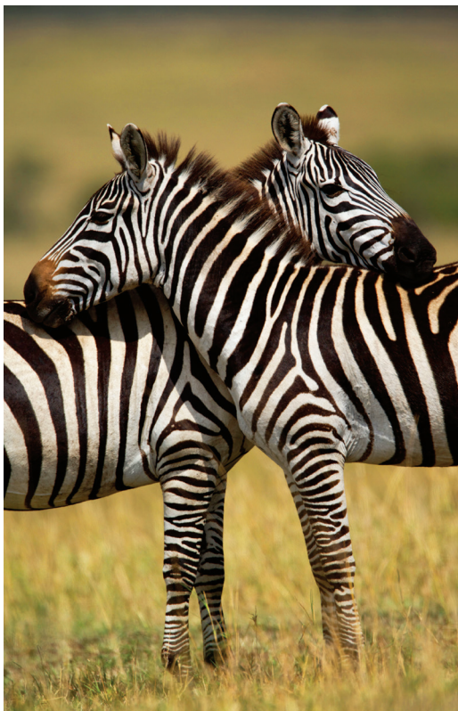
We’re sure to see zebras.